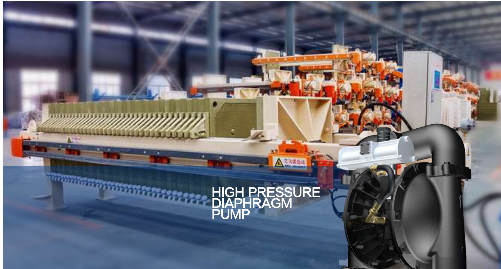
HIGH PRESSURE DIAPHRAGM PUMP